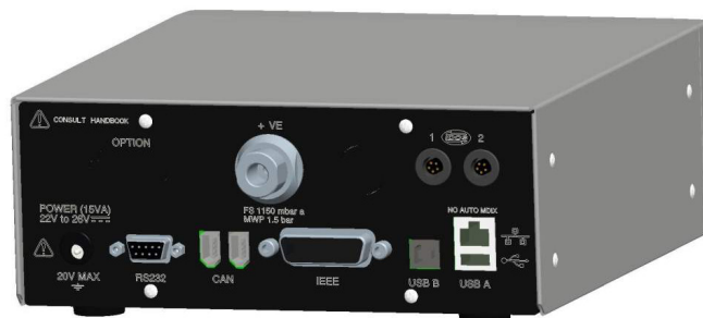
PACE1001 from the rear