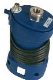
External IDOS universal pressure module